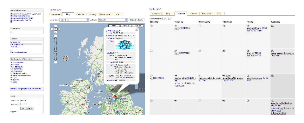
Fig. 2. Map view (left) and calendar view (right) of instance data

Different Views on Instance Data. The OntoWiki prototype facilitates different views on instance data. Such views can be either domain specific or generic. Domain specific views have to be implemented as plug-ins. Generic views provide visual representations of instance data according to certain property values. The following views are currently implemented: