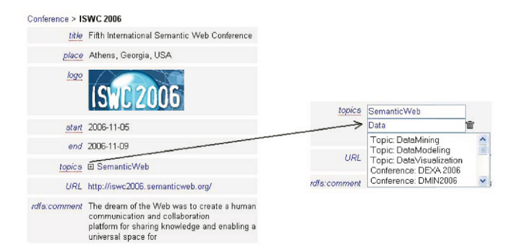
Fig. 3. OntoWiki instance display with statement edit buttons (left). Statement editor with interactive search for predefined individuals based on AJAX technology (right).

For human users it is important that the statements of a knowledge base are presented on the user interface in a way facilitating the efficient reception of this information. To achieve this goal information should be ordered and grouped and as a result of this information appearing redundant should be omitted. If the context clarifies, for example, that some information describes a distinct concept (e.g. since the OntoWiki page for a person was accessed) the concept will be displayed only once on the OntoWiki user interface, even though all the statements describing the concept contain the concepts URI reference as subject. If furthermore a property (e.g. referencing publications) occurs multiple times (e.g. since the person described is author of multiple publications) those statements should be grouped together and the label of the property should be displayed only once (cf. Figure 3).